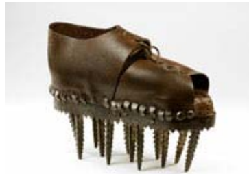
Chestnut crushing clog, France, 1800-1900.

Along with their new fashion area, function is also explored in the revamped section of the 'All About Shoes' gallery called 'What's Their Line', offering visitors an in-depth look at footwear with a purpose over the past two centuries.