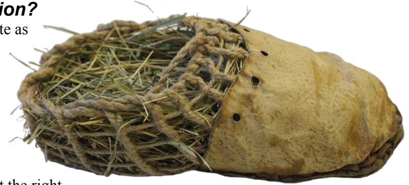
Hlaváček's recreation of Ötzi's shoe.

For example, they had to get the right leather. Tests determined it came from three different animals. They easily sourced the