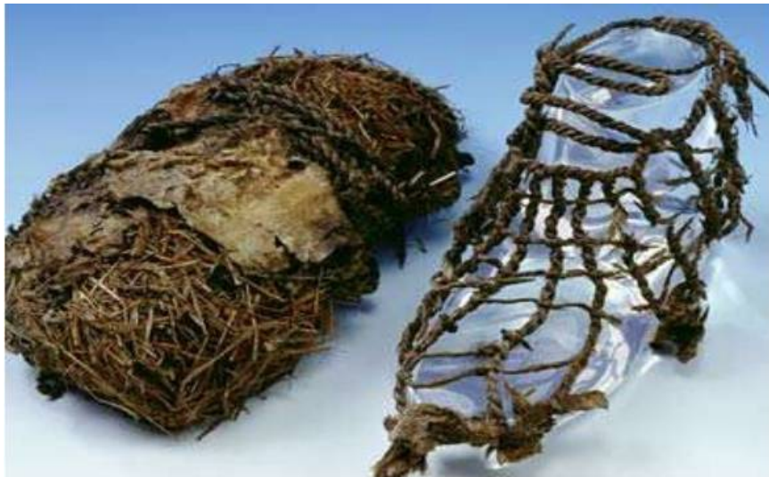
Actual shoe worn by Ötzi.