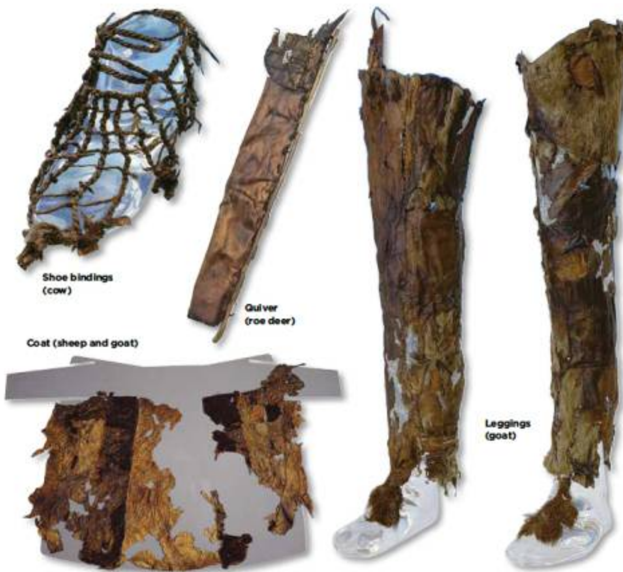
Display of some remains of Ötzi's clothing, identifying materials.

each of the pieces made of and how were they constructed?