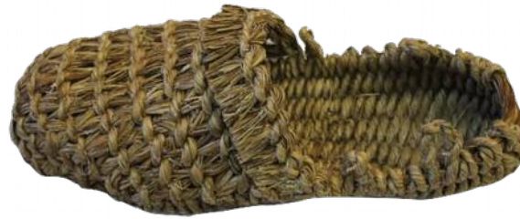
Hlaváček's replica of approx. 10,000 year old shoe from Oregon.

finally begin the work that would take him the next six years to complete. However, there was one other hurdle: Hlaváček was allowed only 20 minutes of "very hard work" to take a plaster cast of Ötzi's feet. The feet, he found, were much smaller and more slender than those of an adult man today - only as big as a 12-year-old boy's.